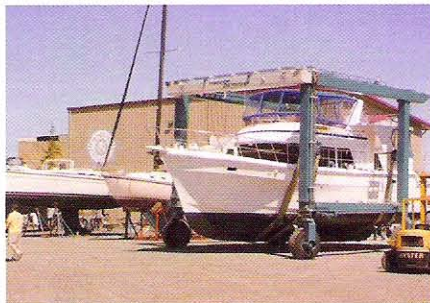
MSC Anacortes yard

"We found a great fit with Marine Servicer, its commitment to a culture of customer attention and service parallels our own philosophy. The rapid growth of our tug 'fleet' has made it apparent that we need a commissioning, service and warranty yard infinitely familiar with our product."