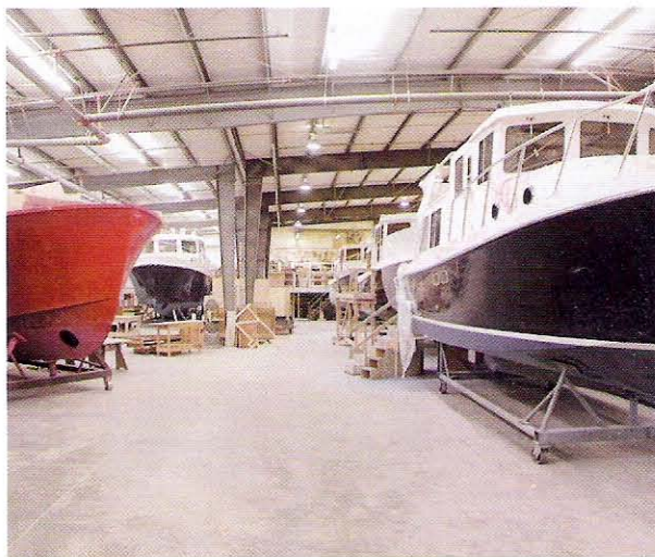
The TOMCO factory

owners with the ability to go coastal cruising in comfort and style. Founded in 2000 by three, well-respected Northwest boatbuilders, TOMCO's evolving fleet of American Tugs offers seaworthiness in combination with reliability. Owners appreciate the opportunity to "live the dream."